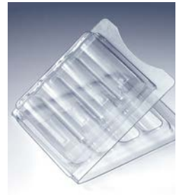
Re-closable hinge clamshell